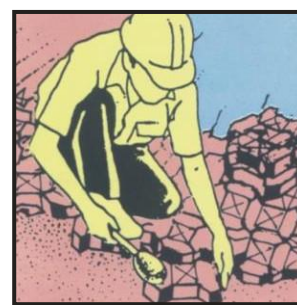
Lay and Interlock Paver Blocks