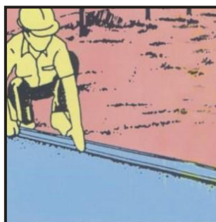
Evenly Spread the Layer of Sand over the Sub-base