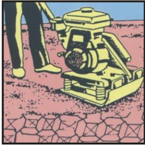
Vibrate the Laid Surface with Fine River Sand