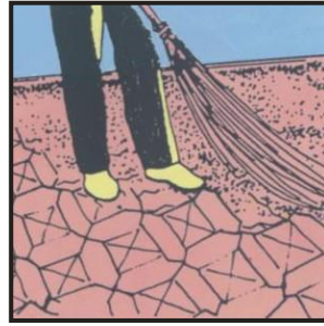
Remove Excess Sand